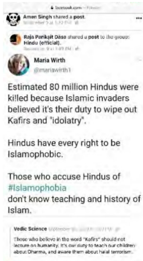
Figure 3: Hindutva's justification of anti-Muslim hate posted on Hindutva digital platform in New Zealand