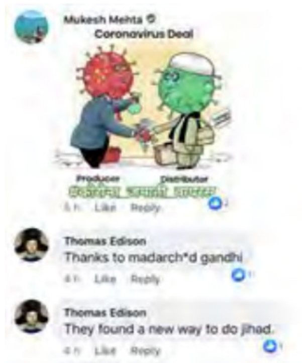
Figure 1: Corona jihad narrative circulated on digital platforms in Aotearoa