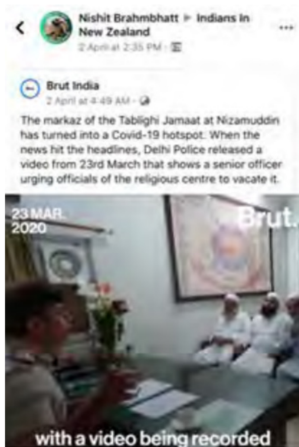
Figure 2: Disinformation around Muslim sources of COVID-19 spread in India being posted on digital platform in New Zealand