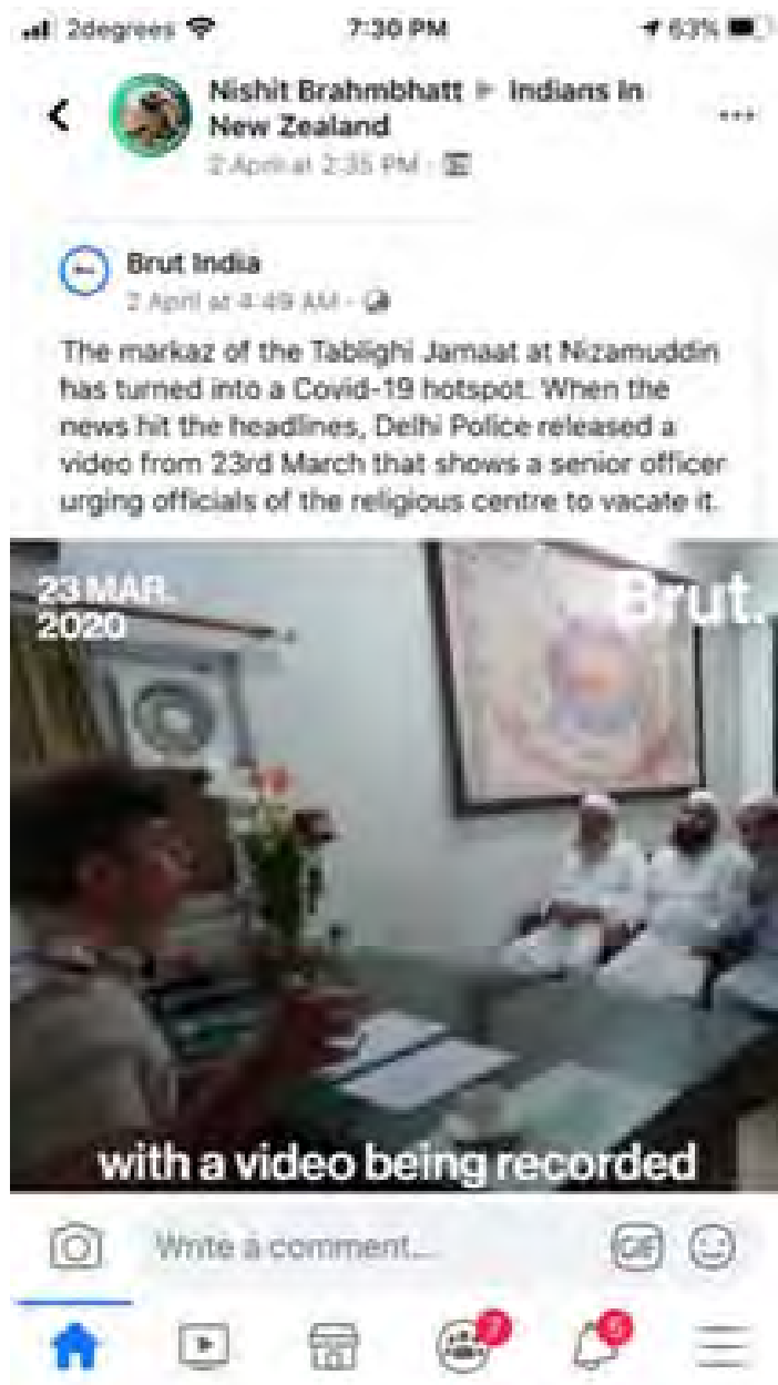
Figure 2: Disinformation around Muslim sources of COVID-19 spread in India being posted on digital platform in New Zealand