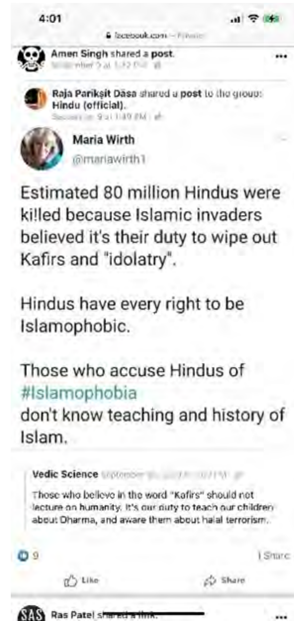
Figure 3: Hindutva's justification of anti-Muslim hate posted on Hindutva digital platform in New Zealand