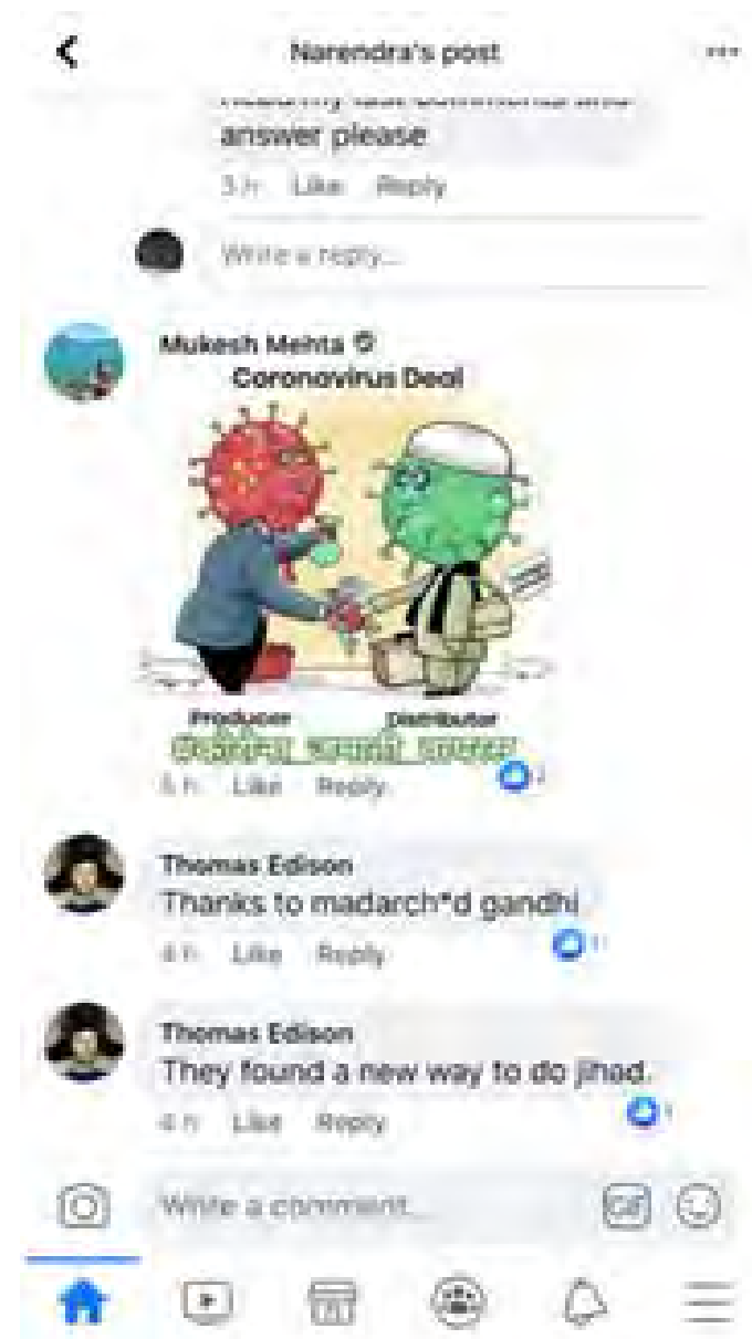
Figure 1: Corona Jihaad narrative circulated on digital platform in Aotearoa